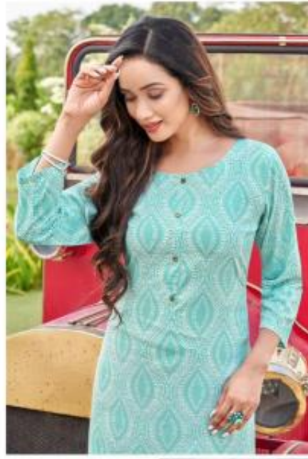
THE MOST BEAUTY