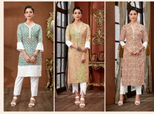
SHEN-46 SHEN-47 SHEN-48