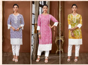
SHEN-43 SHEN-44 SHEN-45

FABRIC Top is pure Viscose, Bottom is Jam Cotton VALUE ADDITION Batique print with heavy lace attachment SIZE S, M, L, XL, XXL, XXXL