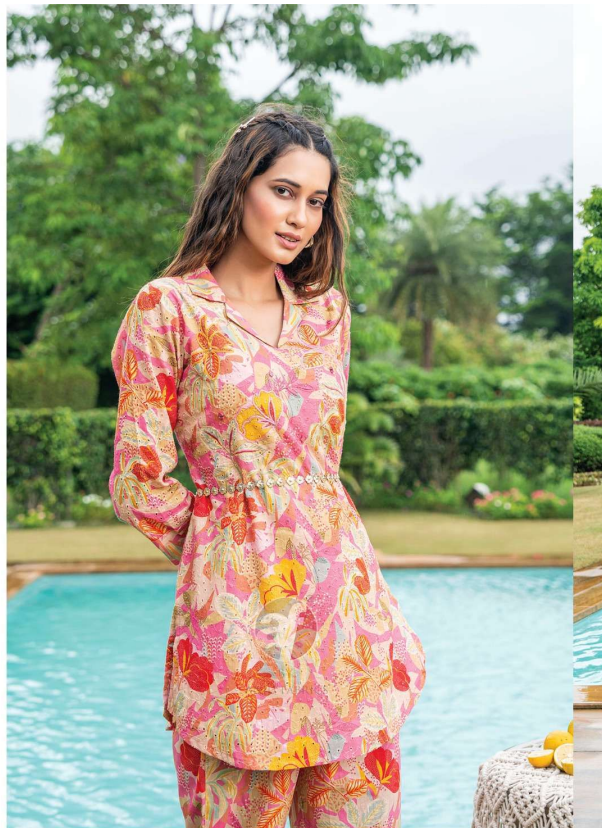
The dress is a classic, I consider it the world's most perfect garment