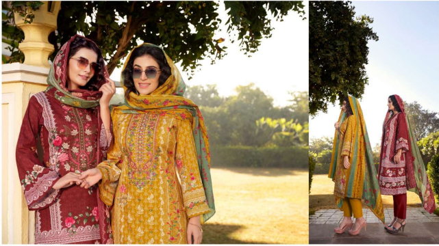
Remains a mystery