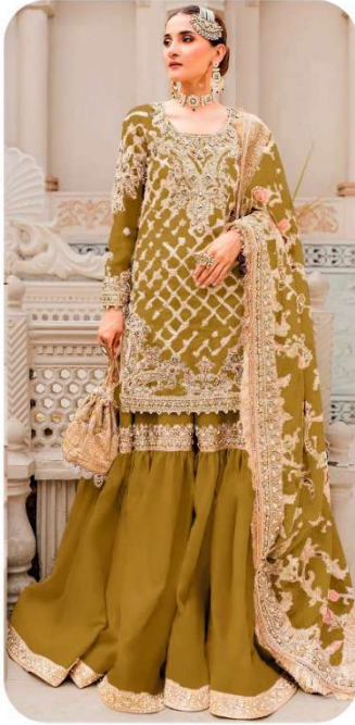
D.No 241 A