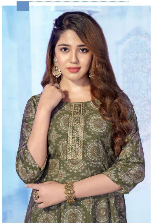
STYLE POPULAR blasting bright color is one of the most favorite fashion trends