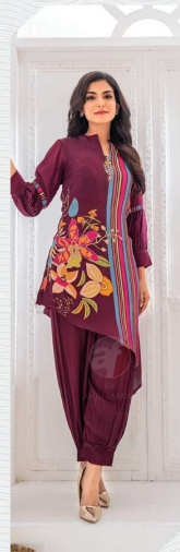
Happy Shades 3405