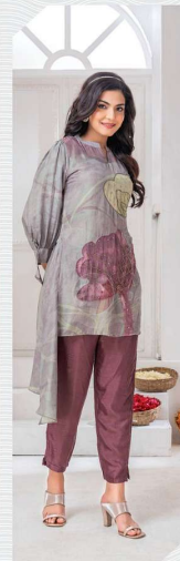
Happy Shades 3406