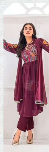
Happy Shades 3402