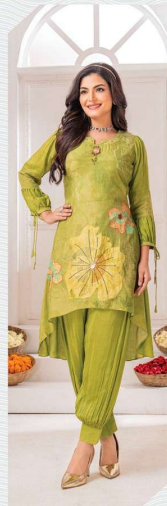
Happy Shades 3404