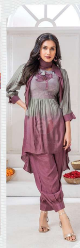
Happy Shades 3403