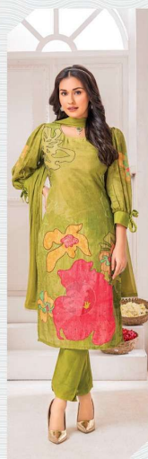
Happy Shades 3401