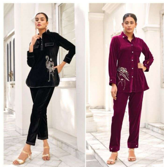
1131 SHEER BLACK