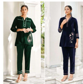
1133 SHEER BOTTLE GREEN