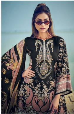
OUTFIT INSTANT CLASSIC In this outfit, it's not the color, only the express yourself from through the 851-008