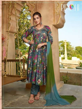
D.No - 1001