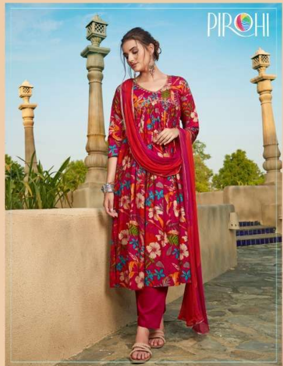
D.No - 1004