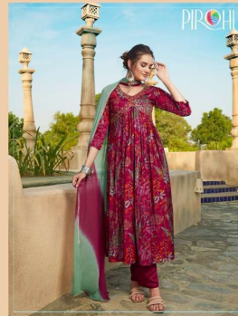
D.No - 1002