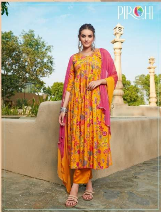
D.No - 1003