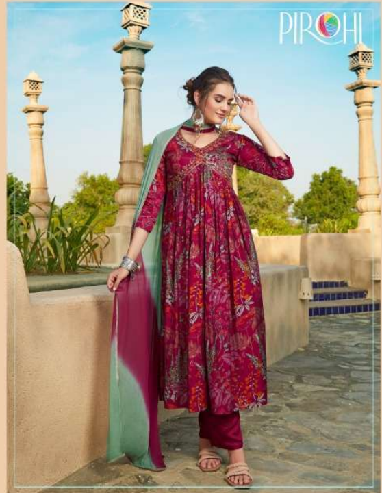
D.No - 1002