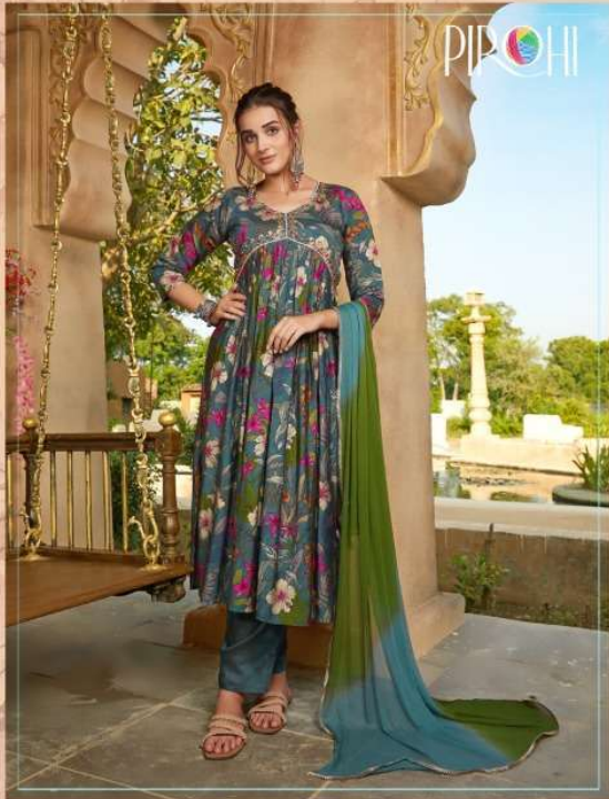
D.No - 1001