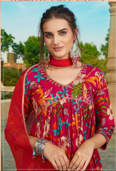
Traditional fashion never means to look after the latest. But to keep the essence of the wardrobe.