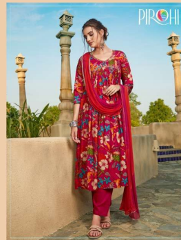
D.No - 1004