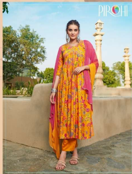
D.No - 1003