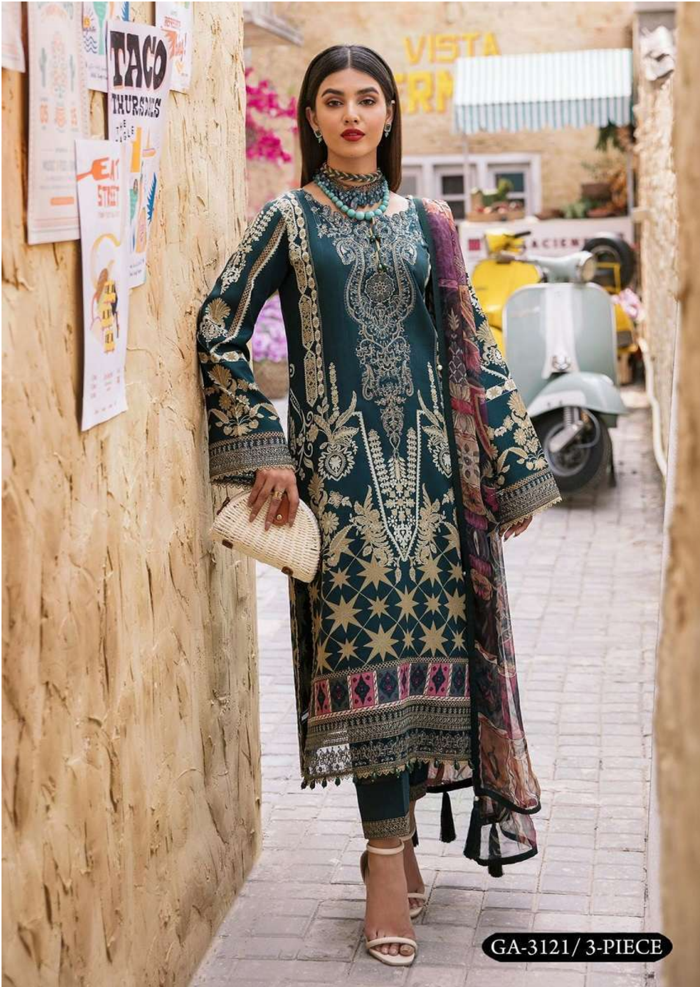
GA-3121 / 3-PIECE