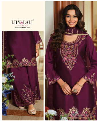
Warning: Viewing this may cause an increase in confidence and confidence. TVEBA-30402