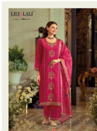
In a world, chasing fleeting trends, true elegance is found in the classics. This outfit isn't just beautiful, it's a testament to the grace, resilience, and rich heritage that defines a culture. Q-29402