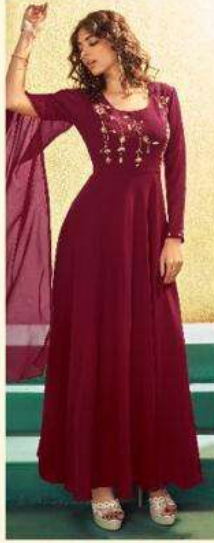
| 1033 |