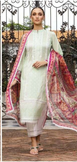
|| 1002 ||