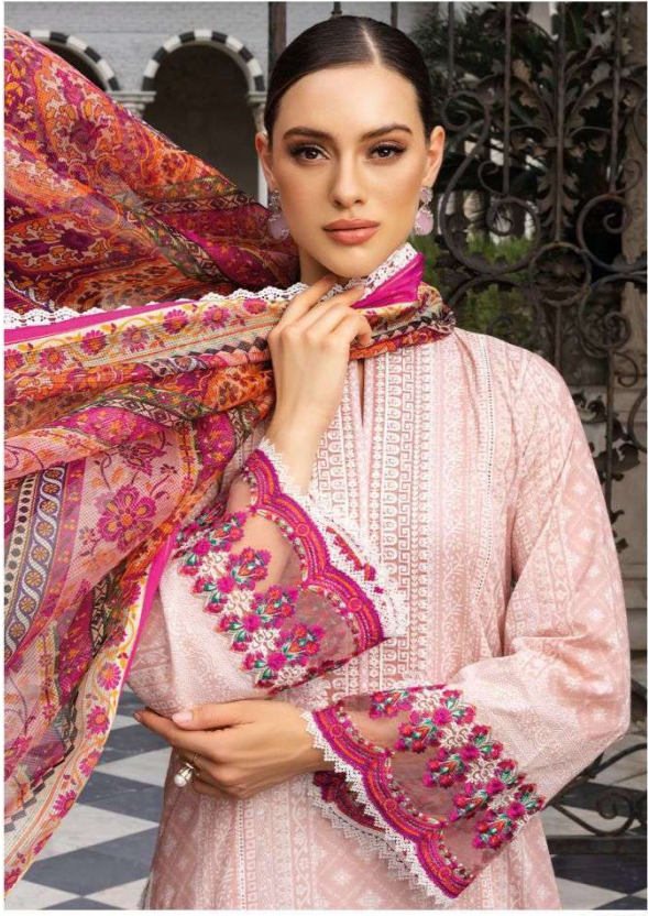
AS GORGEOUS AS YOU || 1001 ||