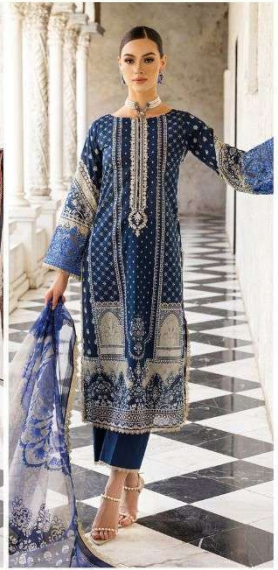
|| 1004 ||