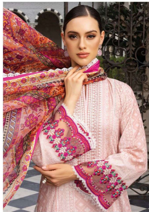
AS GORGEOUS AS YOU || 1001 ||