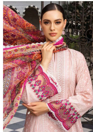
AS GORGEOUS AS YOU || 1001 ||