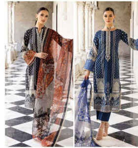
|| 1003 ||