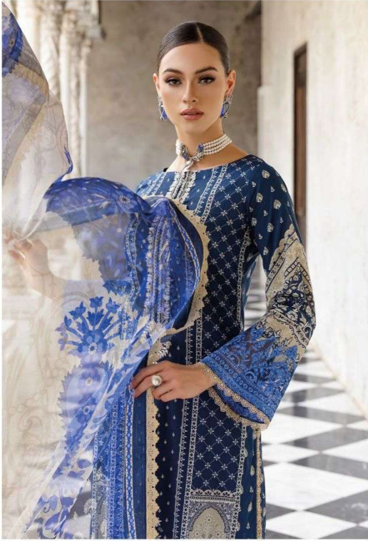
BE EACH DAY BEAUTIFUL || 1004 ||