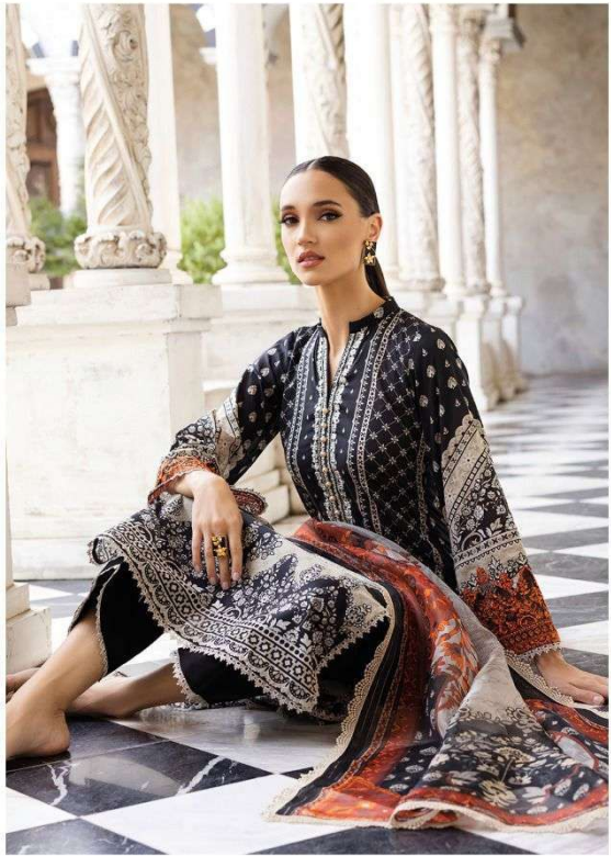
AN AGELESS ADVENTURE || 1003 ||