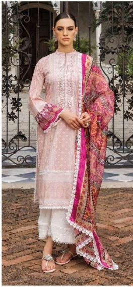
|| 1001 ||