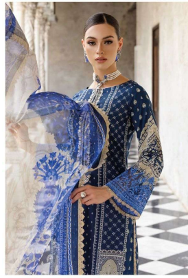
BE EACH DAY BEAUTIFUL || 1004 ||