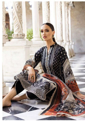
AN AGELESS ADVENTURE || 1003 ||