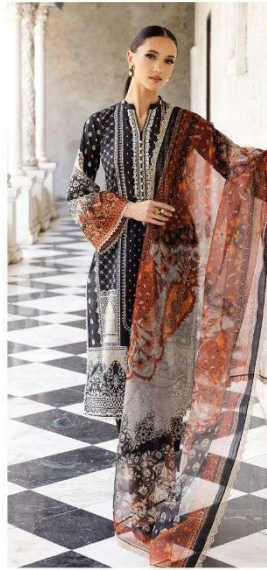
|| 1003 ||