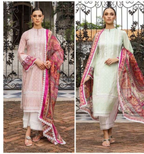
|| 1001 ||