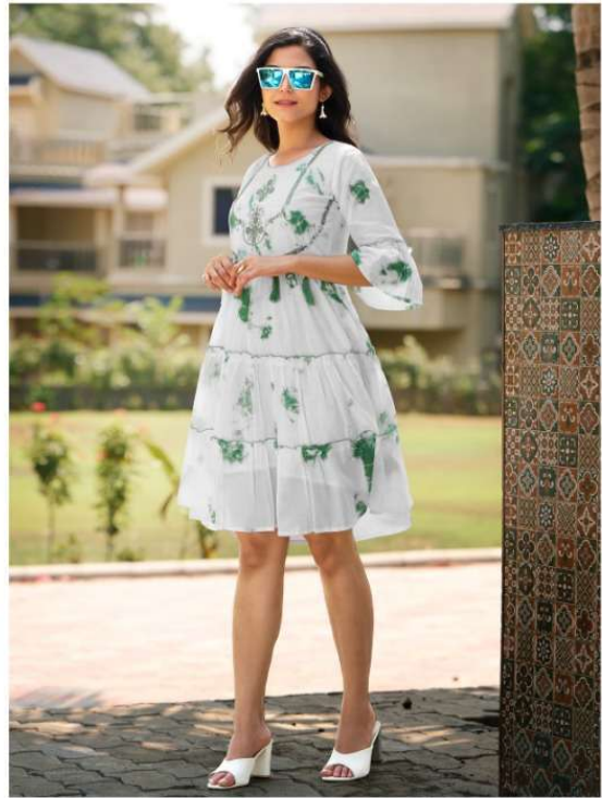
D NO. : 1006