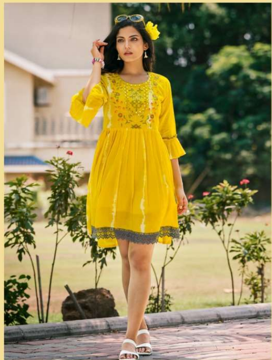
D NO. : 1004