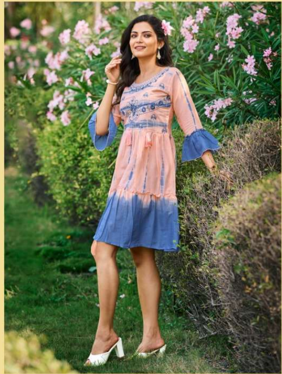
D NO. : 1002