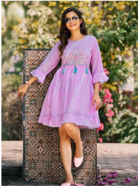
D NO. : 1005