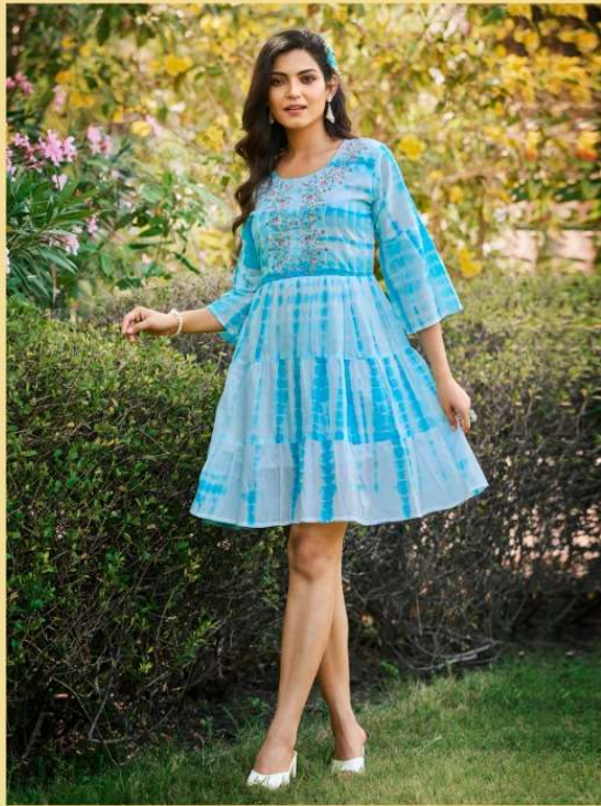
D NO. : 1001