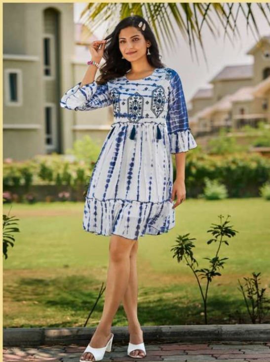
D NO. : 1003