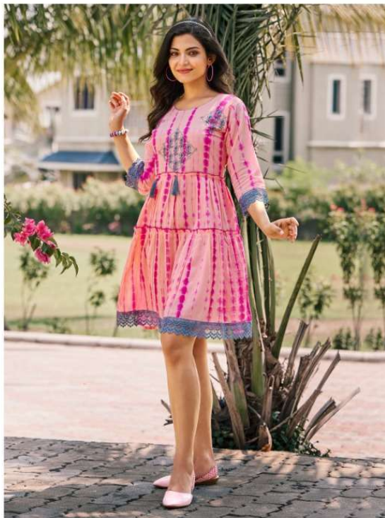
D NO. : 1007