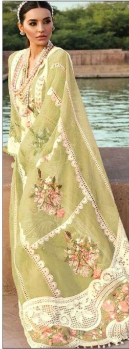
S - 85 J