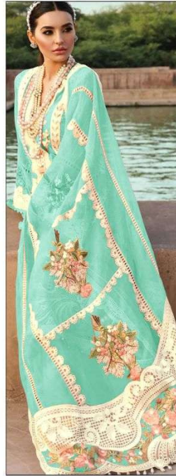
S - 85 L