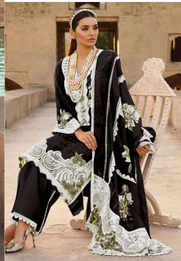
Top - Lawn cotton heavy embroidered with neck emb patch Bottom - Semi lawn cotton Dupatta - Butterfly net heavy embroidered

Serena Pakistani Suit A BRAND BY MEGHA EXPORT S - 85 M