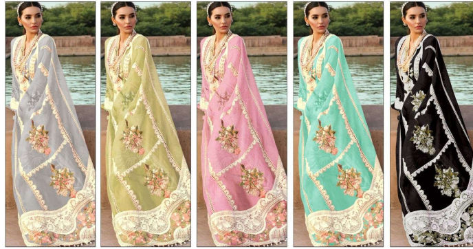
S - 85 I

Top - Lawn cotton heavy embroidered with neck emb patch Bottom - Semi lawn cotton Dupatta - Butterfly net heavy embroidered