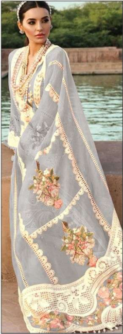
S - 85 I

Top - Lawn cotton heavy embroidered with neck emb patch Bottom - Semi lawn cotton Dupatta - Butterfly net heavy embroidered