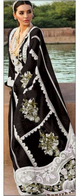
S - 85 M