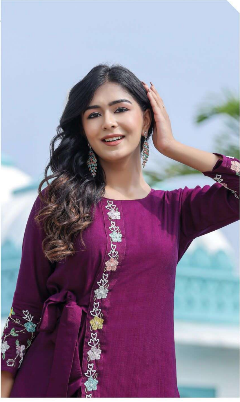
B l o s s o m c o l l e c t i o n