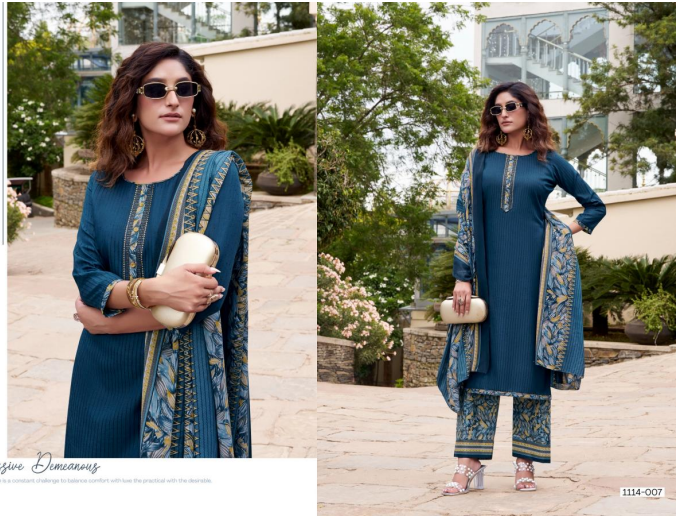
Impressive Demands Design is a constant challenge to balance comfort with how the practical with the desirable.