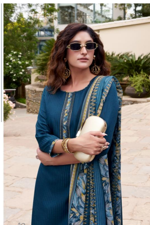
Impressive Demeanor Design is a constant challenge to balance comfort with how the practical with the desirable.