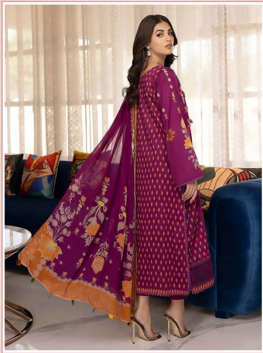
AYESHA ZARA PREMIUM COLLECTION VOL-8