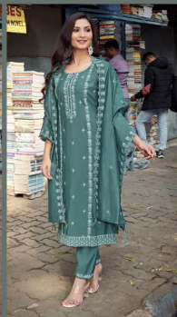
- D.NO. 1005 -