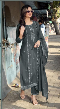
- D.NO. 1002 -