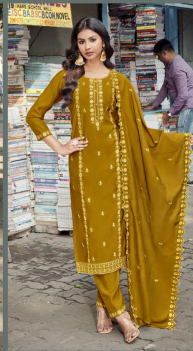
- D.NO. 1003 -