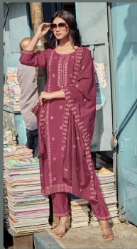
- D.NO. 1001 -