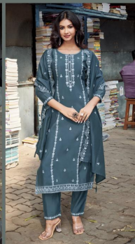
- D.NO. 1006 -