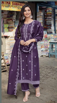
- D.NO. 1004 -