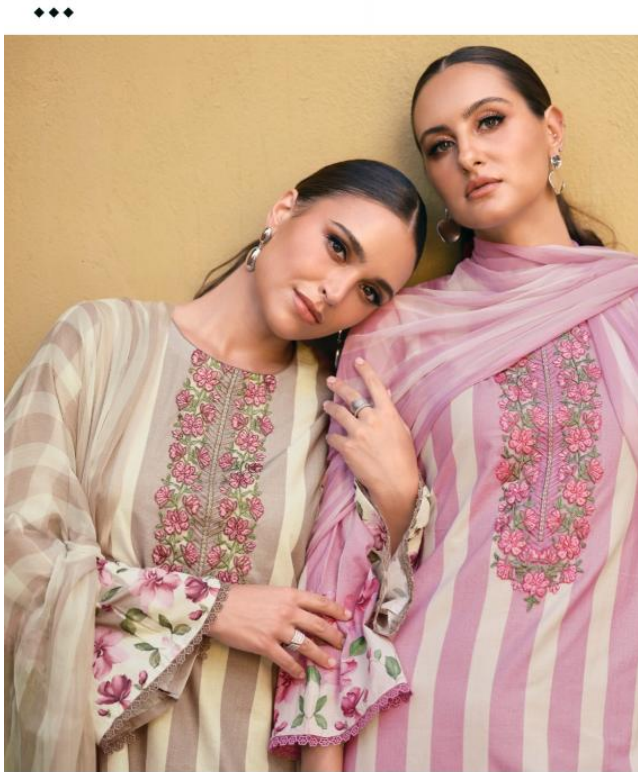
Threads that connect the past to the present.