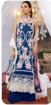
D.No 224 A