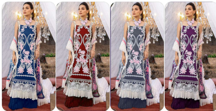
D.No 224 A