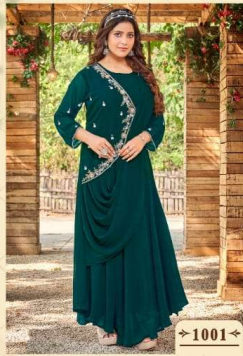
→ 1001 ←