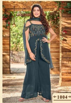
→ 1004 ←