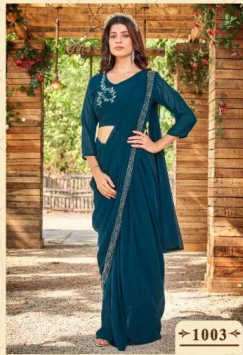
→ 1003 ←