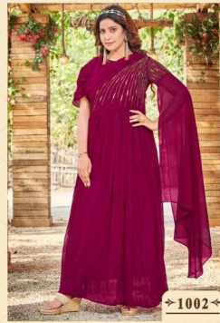
→ 1002 ←