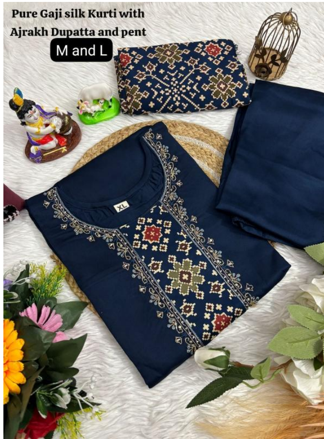
Pure Gaji silk Kurti with Ajrakh Dupatta and pent M and L