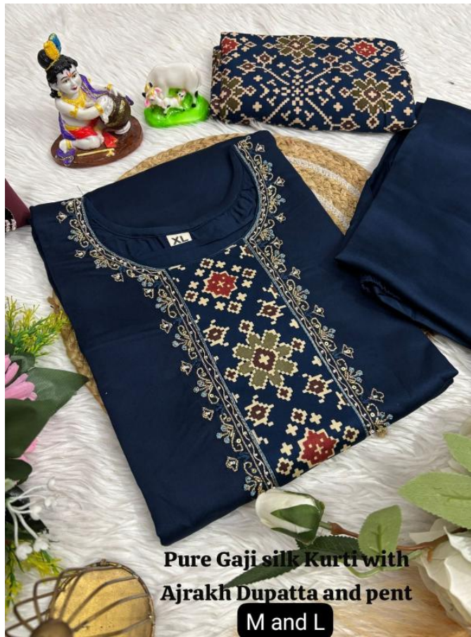
Pure Gaji silk Kurti with Ajrakh Dupatta and pent