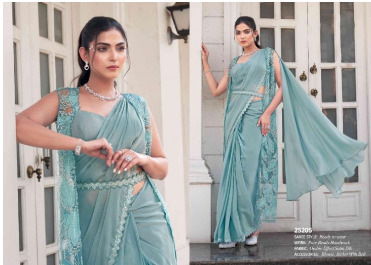
25205 SAREE STYLE: Ready to wear WORK: Pure Beads Handwork FABRIC: Under Effect Satin Silk ACCESSORIES: Blouse, Jacket With Belt