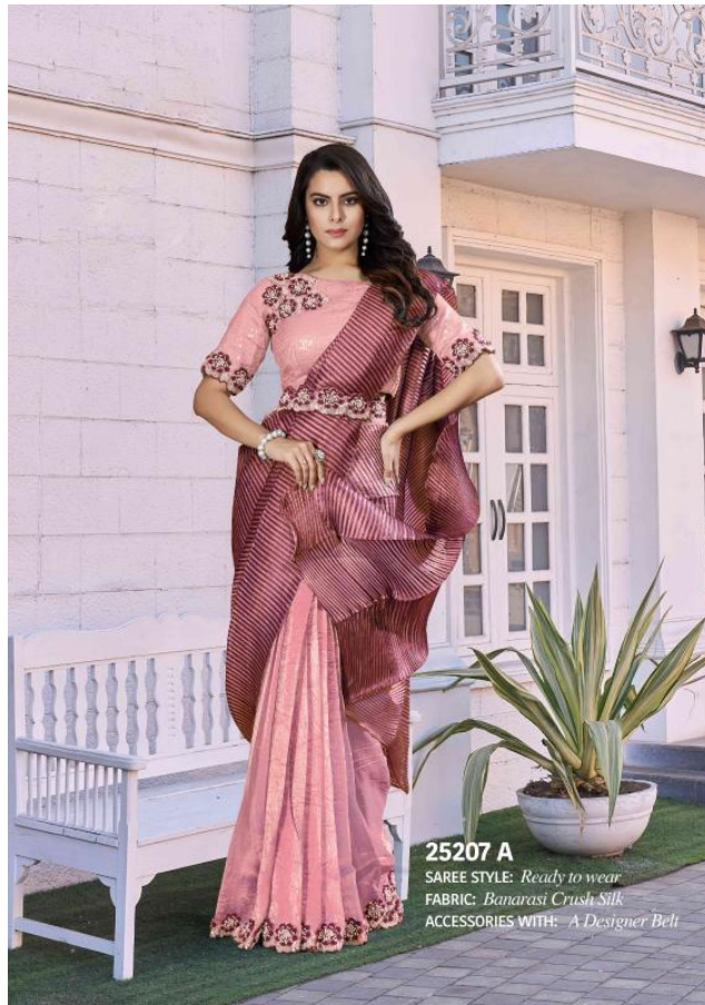
25207 A SAREE STYLE: Ready to wear FABRIC: Banarasi Crush Silk ACCESSORIES WITH: A Designer Belt