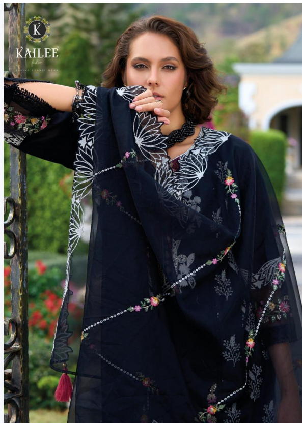
Style and sophistication