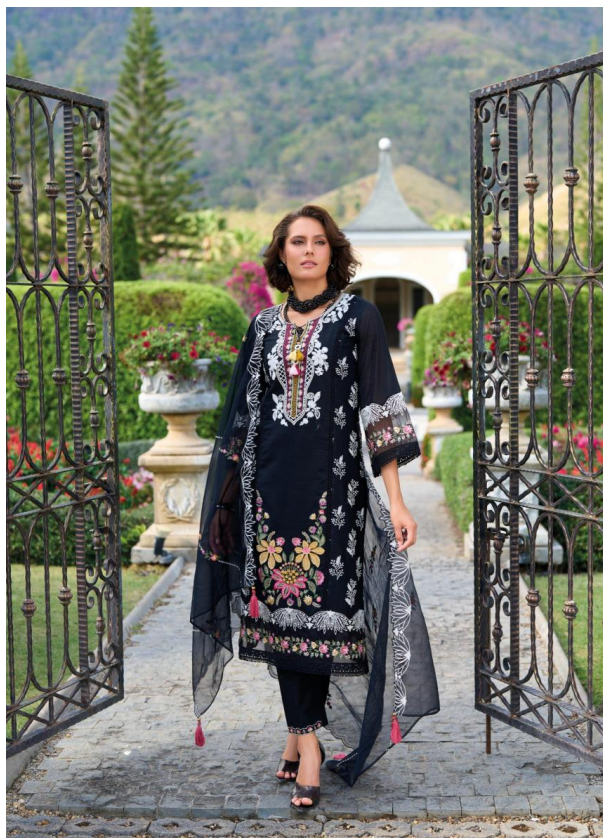
This elegant purple and white printed suit is designed for the modern woman who values both style and sophistication