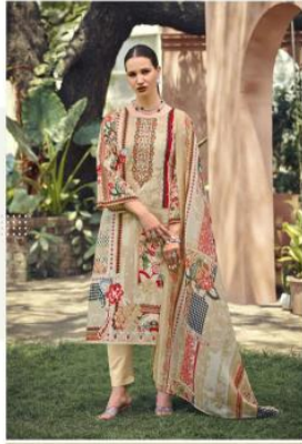
Photo credit: Riaz Arts. All rights reserved. For more information, visit www.riazarts.com