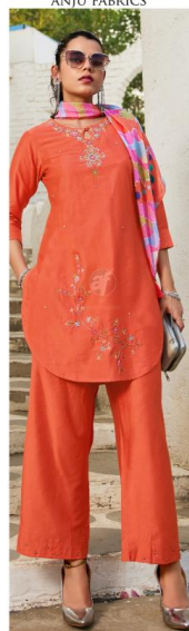
1212 FUSION VOL-05