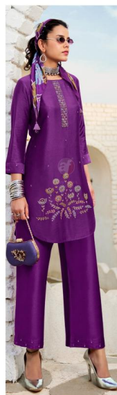
1211 FUSION VOL-05