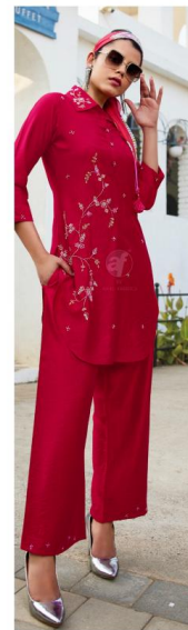
1216 FUSION VOL-05