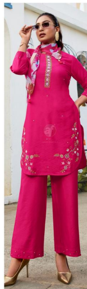
1211 FUSION VOL-05