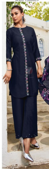
1215 FUSION VOL-05