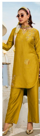
1213 FUSION VOL-05