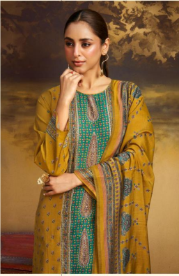
AN ELEGANT LOOK We are proud to have been part of the most popular fashion collections of the world.