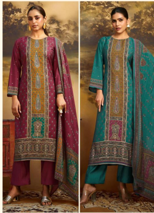
CODE | 3801