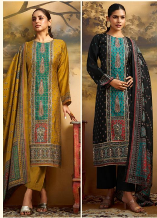
CODE | 3803