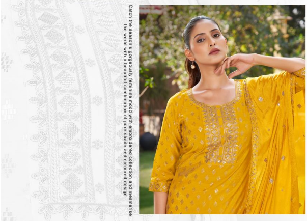
Catch the season's spirit with elegant, feminine style with sophisticated embroidery and a mesmerizing combination of pure hues and vibrant design.