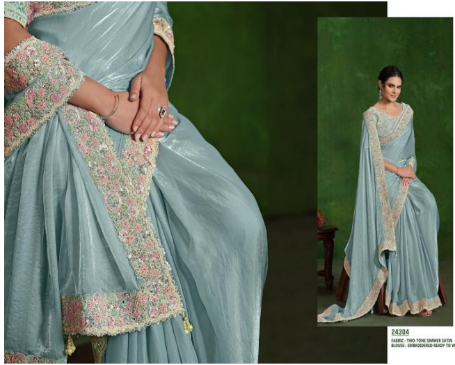
24304 FABRIC: PINK-TONE SHIMMER LACE BLOUSE | UNBROUDED READY TO WEAR