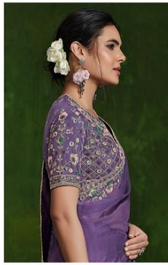
24301 FABRIC : NATURAL CHEER GODORGETTE SILK FINISH : EMBROIDERED READY TO WEAR