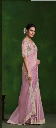
24305 FABRIC: PAPER CREPE SILK REQUIN | IMMEDIATELY READY TO WEAR

Ranghita is a collection that is specifically created to make your special moments memorable.