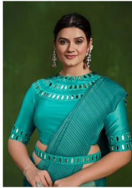
The alluring effect of a masterpiece with intricate beauty makes it an exquisite piece of fashion craft!