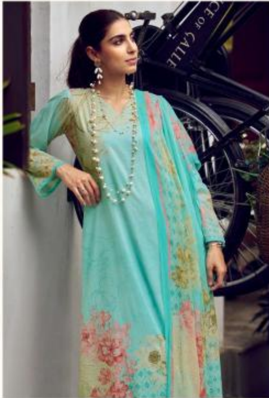
Shakti the Jewels to brighten up your look.