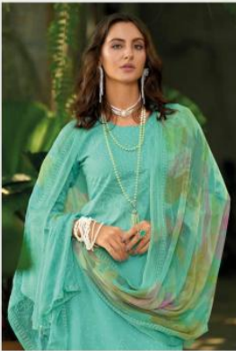
FASHION IS A SAGA