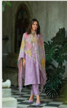
THE MOST COURAGEOUS