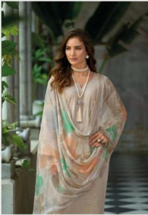
CHANGE THE HELTHIEST