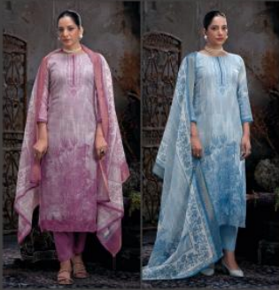
1004 - A