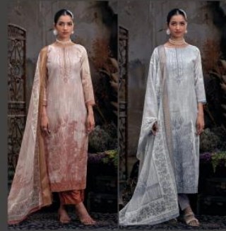
1004 - C