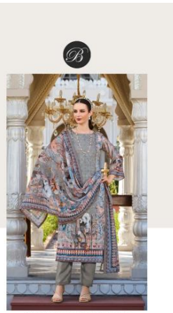
طوبیاء کے لئے ایک نیا ڈیزائن 827-001