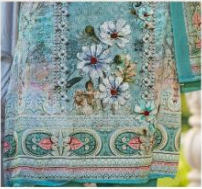
■ ■ ■ ■ 827-003 ■ ■ ■ ■