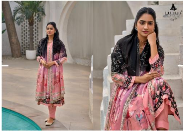
LINKING FASHION WITH RELAXATION