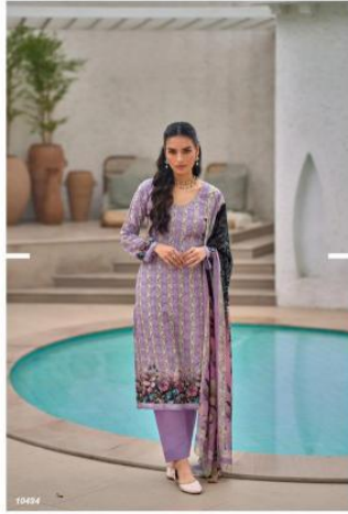
15494 THE NEW FALL OF FASHION '17