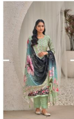
10496 KEEP CALM & SURROUND YOURSELF WITH FASHION.