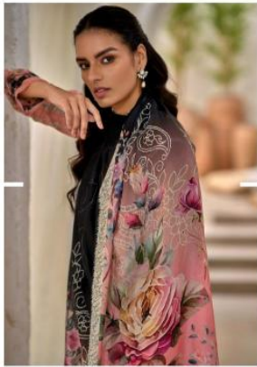
DESIGNS THAT WILL MAKE YOU COMFORTABLY BEAUTIFUL