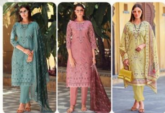
Style No./ 1901