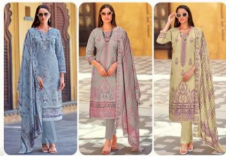
Style No./ 1904