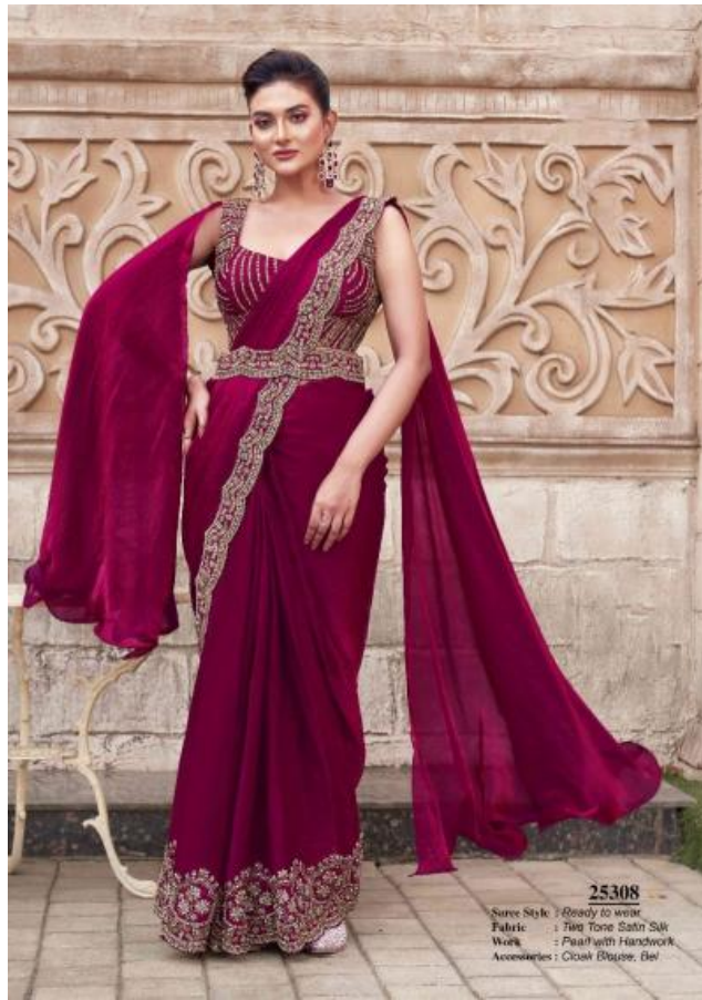
25308 Saree Style : Ready to wear Fabric : Red Tone Satin Silk Work : Paanji with Handwork Accessories : Clavet Bangle, Eel