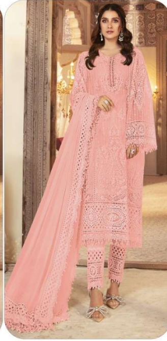
D.No | 211-C