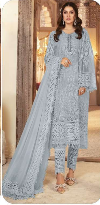
D.No | 211-B