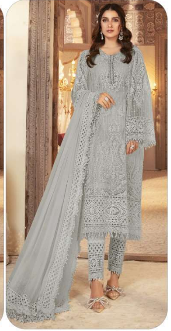
D.No | 211-D