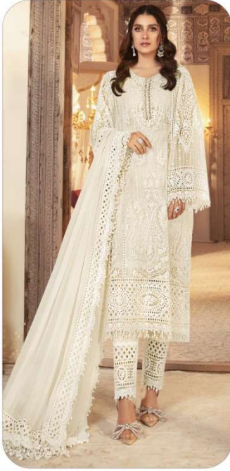
D.No | 211 A