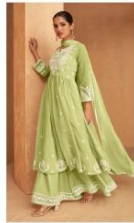
D NO : 2021