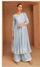
D NO : 2023