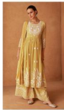
D NO : 2024