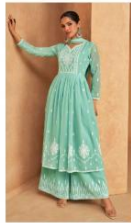
D NO : 2022