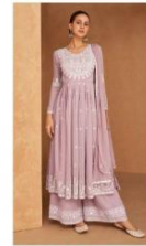
D NO : 2026