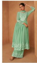
D NO : 2025