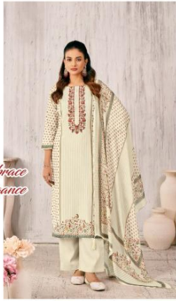
Embrace sheer elegance with the most celebrated Indian attire. 98003