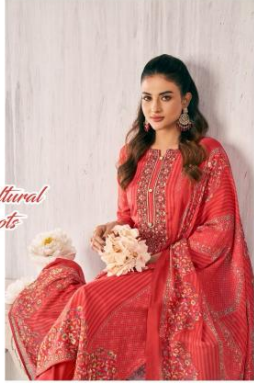
• Cotton dress with shagun, embroidered with golden thread