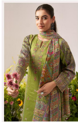
The Timeless Elegance 8802