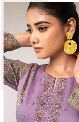
5800 A PAIR OF SHAWL OF TRADITIONAL AND FINEST