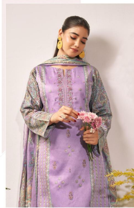
A Perfect Blend of Tradition and Trend 8805