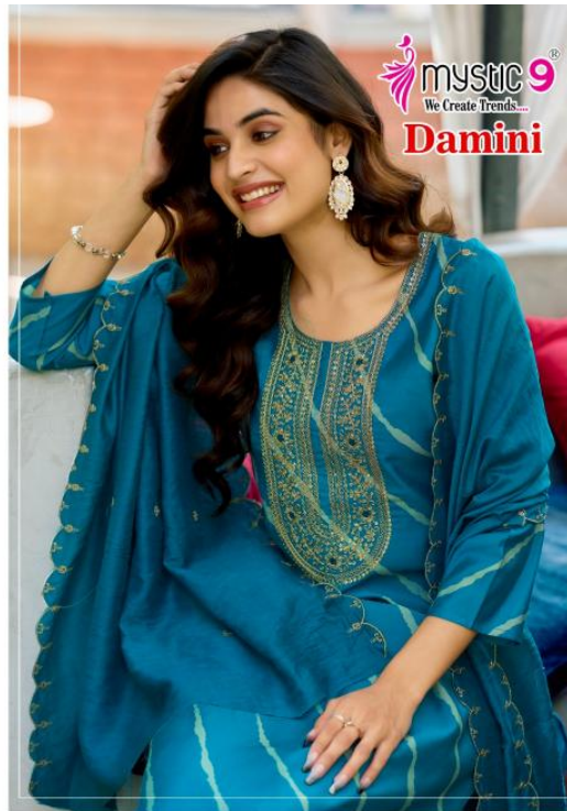
The simple yet comfortable garment originated in the northern states of Punjab