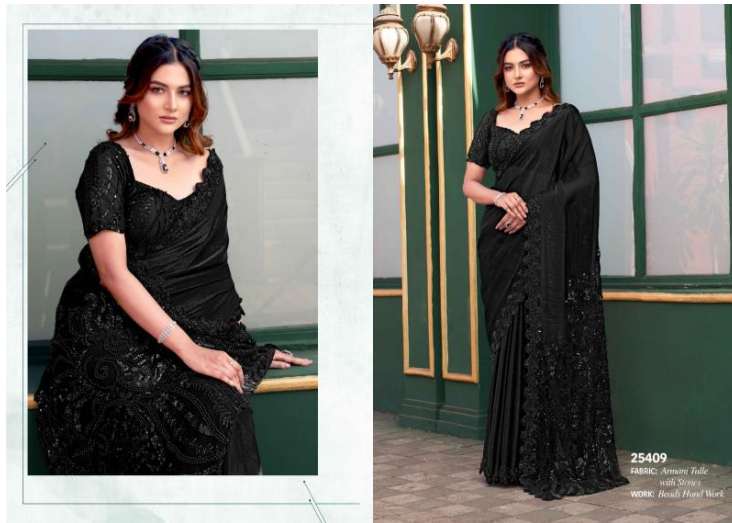
25409 FABRIC: Ammiri Tulle with Stones WORK: Hand Hand Work