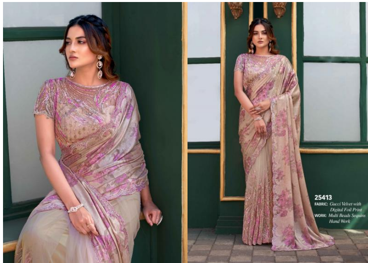
25413 FABRIC: Cauci Velvet with Digital Foil Print WORK: Multi Beads Sequins Hand Work