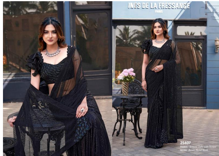
25407 FABRIC: Armani Tulle with Swoosh Access: Beads Floral Work