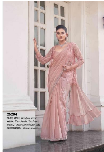
25204 SAREE STYLE: Ready to wear WORK: Pure Beads Handwork FABRIC: Centre Effect Saree, Silk ACCESSORIES: Blouse, Jacket