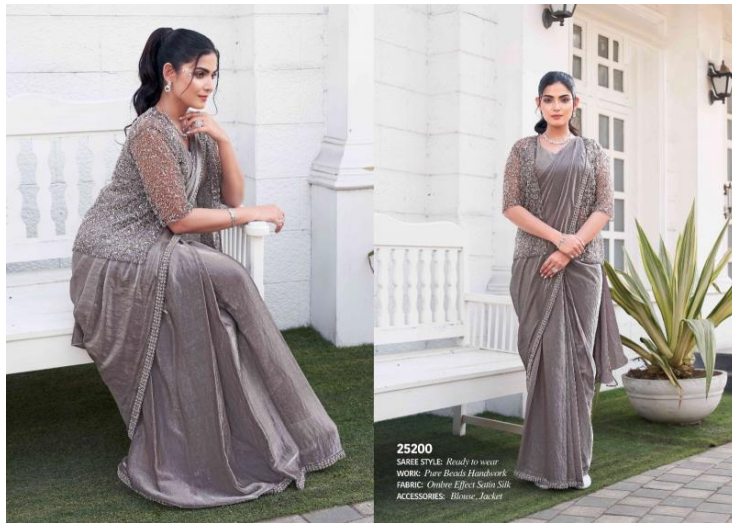
25200 SAREE STYLE: Ready to wear WEAVE: Pure Handmade Handloom FABRIC: Ombre Effect Satin Silk ACCESSORIES: Blouse, Jacket