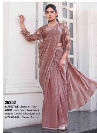
25202 SAREE STYLE: Ready to wear WORK: Pure Bead's Handwork FABRIC: Ombre Effect Satin Silk ACCESSORIES: Blouse, Jacket