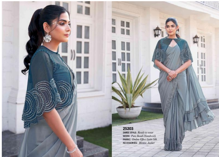
25203 SAREE STYLE: Ready to wear WORK: Pure Bead/ Handwork FABRIC: Ombre Effect Satin Silk ACCESSORIES: Blouse, Jacket