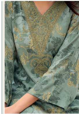
The best things in life are free. The second best are very expensive