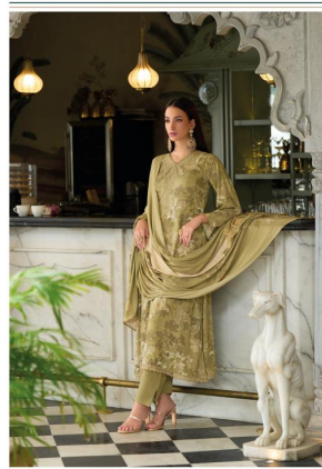
Fashion is the armor to survive the reality of everyday life