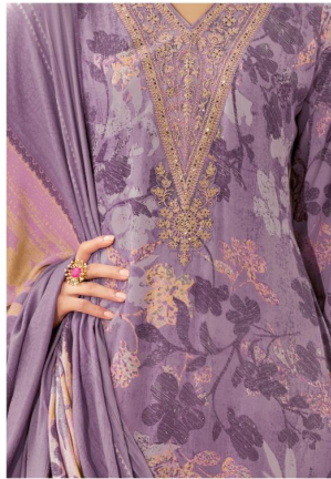
— Fashion is the armor to survive the reality of everyday life