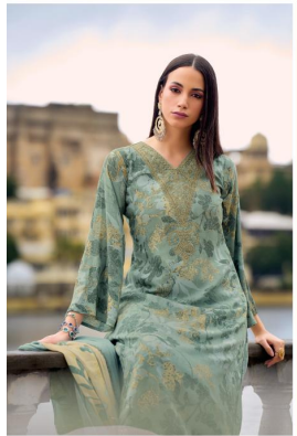
The best things in life are free. The second best are very expensive