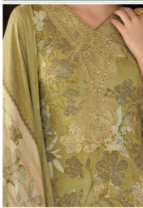
Fashion is the armor to survive the reality of everyday life