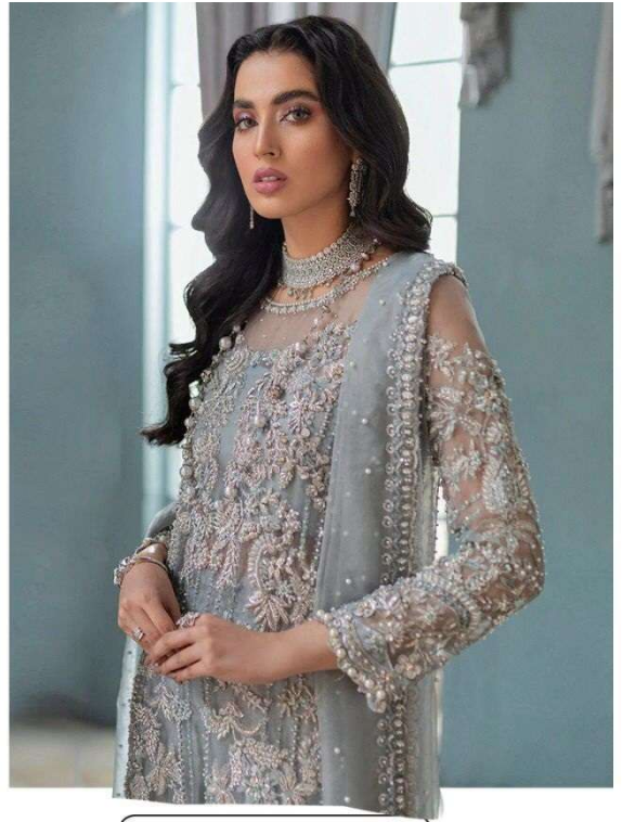
D.NO.148 TOP:-ORGANZA INNER:-SANTOON BOTTOM:-SANTOON DUPATTA:-ORGANZA