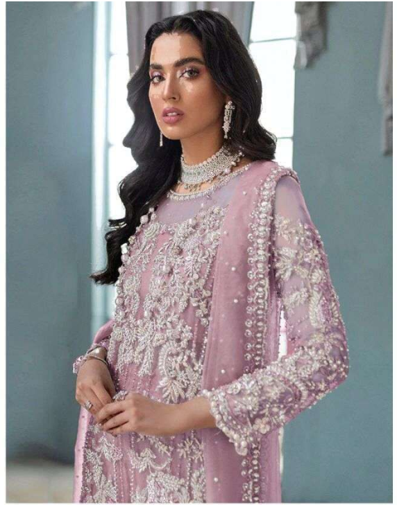
D.NO.148-A TOP:-ORGANZA INNER:-SANTOON BOTTOM:-SANTOON DUPATTA:-ORGANZA