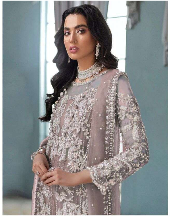
D.NO.148-B TOP:-ORGANZA INNER:-SANTOON BOTTOM:-SANTOON DUPATTA:-ORGANZA