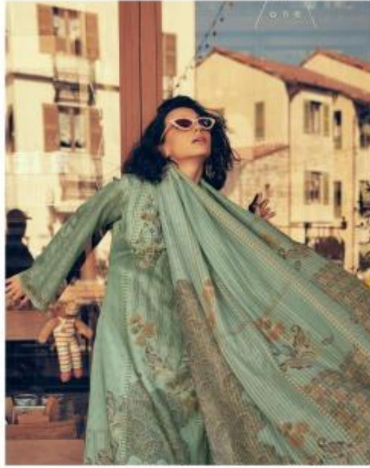
Kanheri shawl elegantly with the new collection in India series.