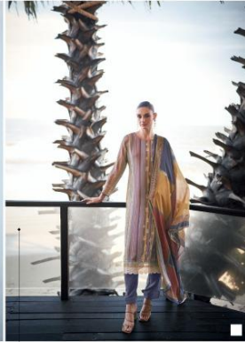
If you are someone who likes to stand out, you should go for this. It is the right piece for you.